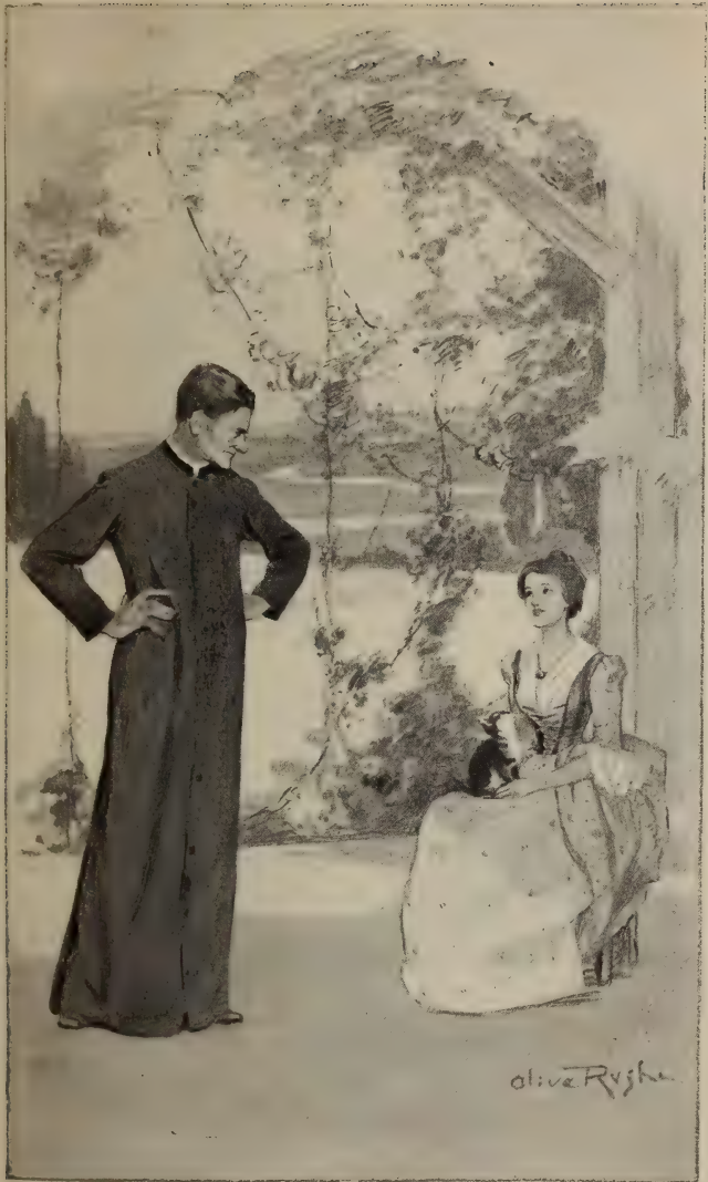
“ The Black Abbé turned and gave her a long, penetrating look, full of irony.”—(Page 164.)